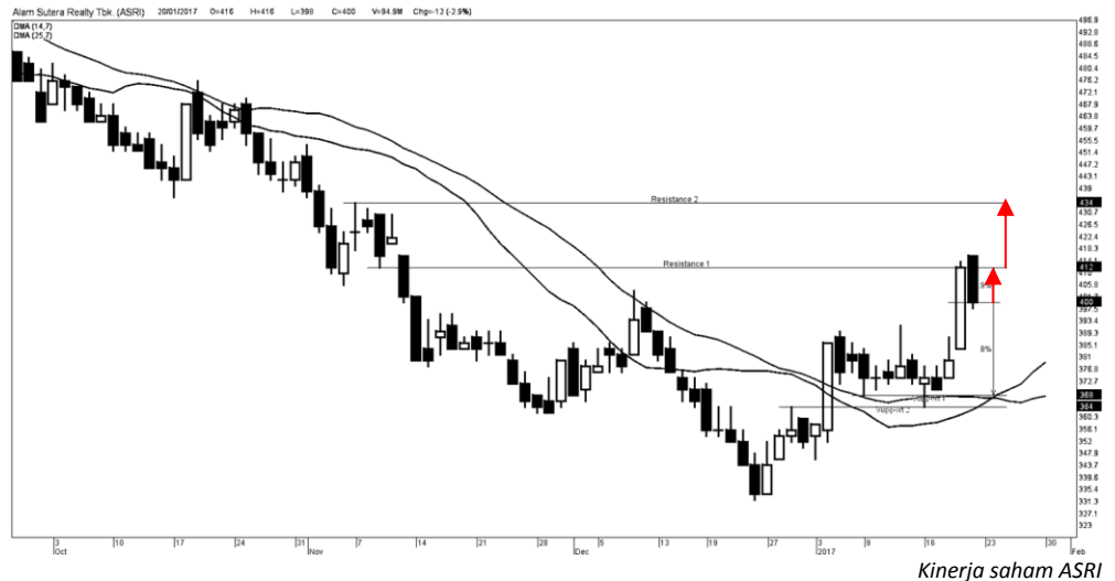
Kinerja saham ASRI

Danareksa research report are also available at Reuters Mulfex and First Call Direct and Bloomberg